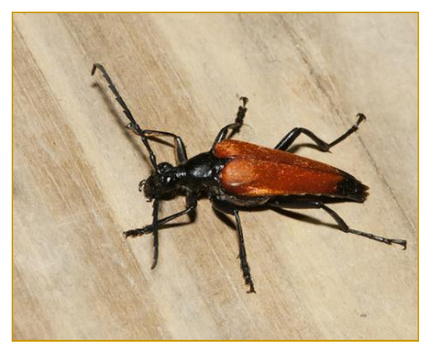
Flower Longhorn Beetle