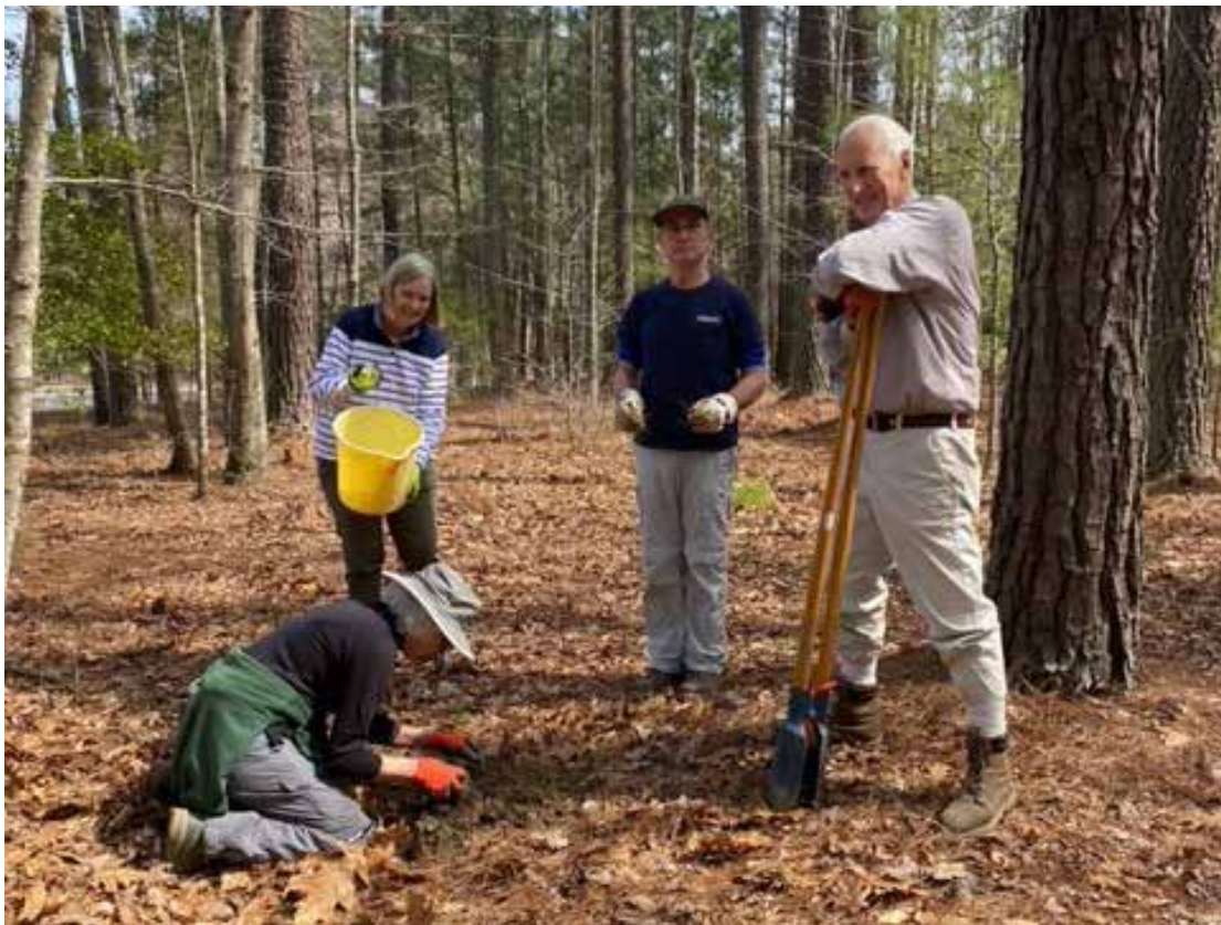
Tree-planting at Freedom Park

This tree planting project has benefited by cooperation of several Adopt-a-Park programs, Tree Stewards, Girl Scouts, Master Naturalists, and other community volunteers. If you take a walk over to the Settlement, many of the new seedlings are marked with mesh tree protectors, so they are easy to spot.