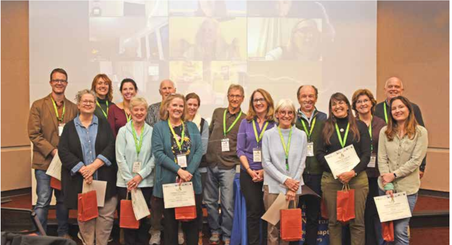
Virginia Master Naturalists, Historic Rivers Chapter, Cohort XV

years! Let's hear it for age diversity! Seven members of Cohort 1 completed their course of training in 2021 but we were unable to celebrate with them at that time. The certificates were kept safe and presented as candid photo slides were shown on the big screen. Five members of Cohort 2 were presented with their certificates of training completion, also. Seeing these new members in person and on the screen brought smiles to all. And please remember to offer rides to these members to help them share in our many varied activities, projects, and celebrations.