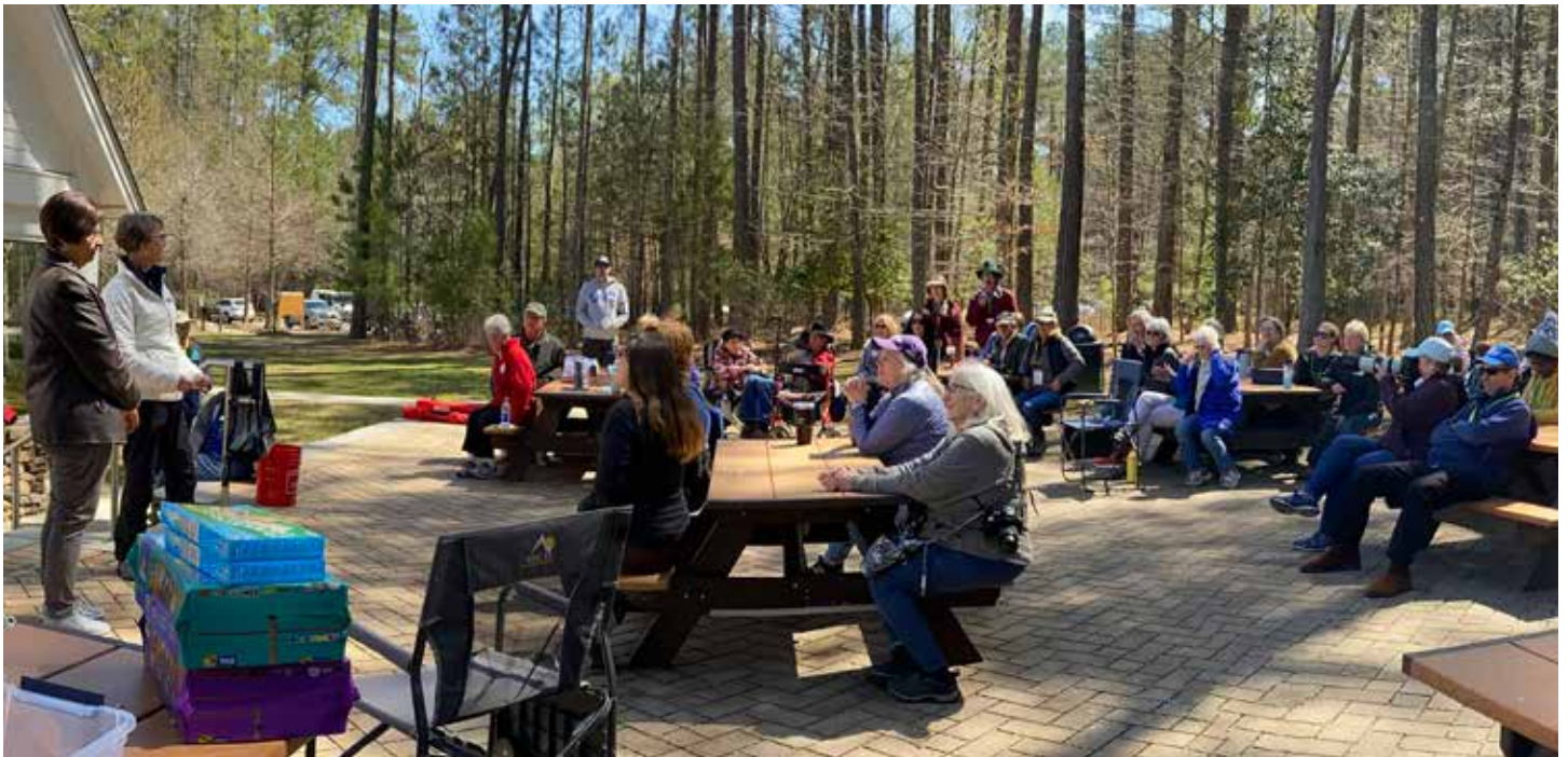
Cohort XV Graduation Picnic