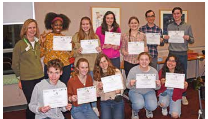
William & Mary's Cohorts 1 & 2